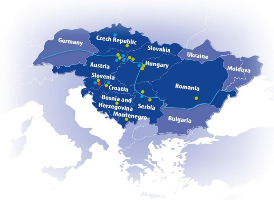
Figure 1. DriDanube project partners

Drought is a larger scale natural disaster, therefore, the transnational cooperation is especially important. Project partnership consists of the most relevant institutions, which are directly or indirectly involved in drought monitoring and management in 10 countries of the region (Figure1). 15 project partners and 8 associated strategic partners are from 7 EU and 3 non-EU countries.